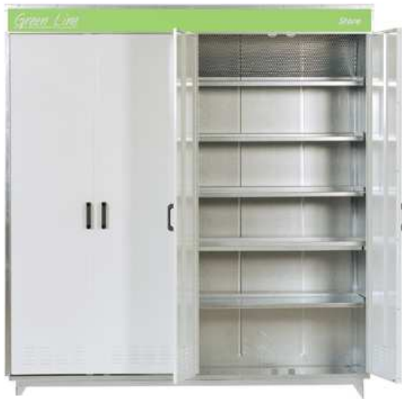
The picture shows a Store 195 (2-7195S).